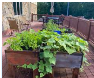
Deck garden means free veggies for all