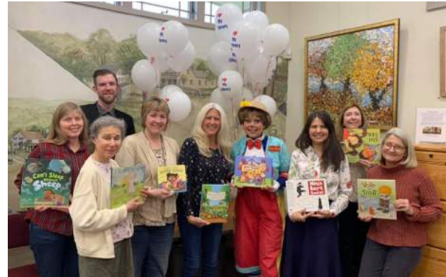
Pre-Pandemic Children's Literary Festival

If this year has taught us anything, it's that the connections and relationships in our community are what really matter. When we were required to close in March, staff worked from home on various projects. One of the most rewarding was wellness checks to our elderly residents to help them get groceries, medicine or just chat. When we reopened the first week of June, we piloted locker pickup, which continues to be popular. We also ran a food drive in September and October and were grateful to see the community supporting our local food pantry.