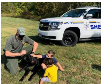
Community Heroes Day - Thank you First Responders