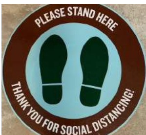
We can't wait for this photo to be filed in local history

2,678 NEW ITEMS PURCHASED FOR THE COLLECTION