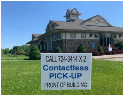
We continue to offer contactless locker pickup