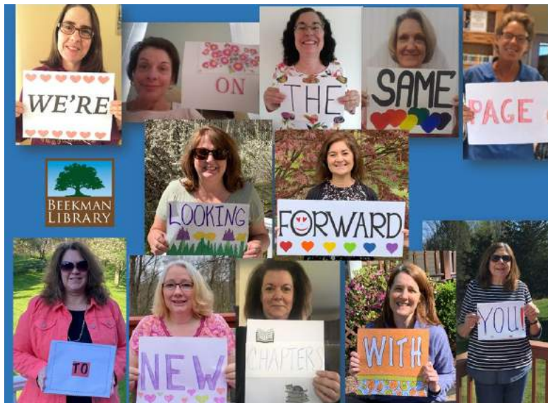
Our message to you when we were all working from home