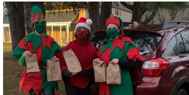
We loved participating in Beekman's Festival of Lights

This has been a very tough year for connecting with neighbors and that is what library programs are about. We focused on what we could do, online and outdoors, including events in collaboration with the Beekman Recreation Department.