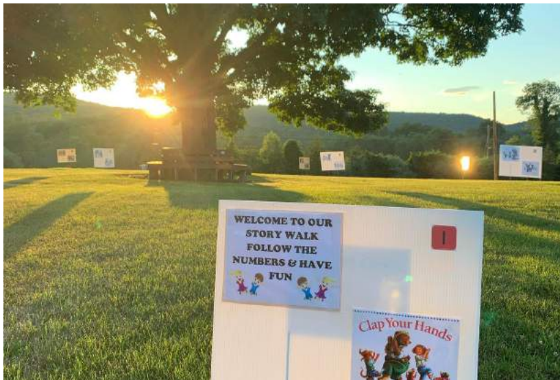
Our story walks allowed children to walk through a story book